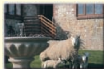
"A mother and her 3 children trespassing on the Stables lawn"