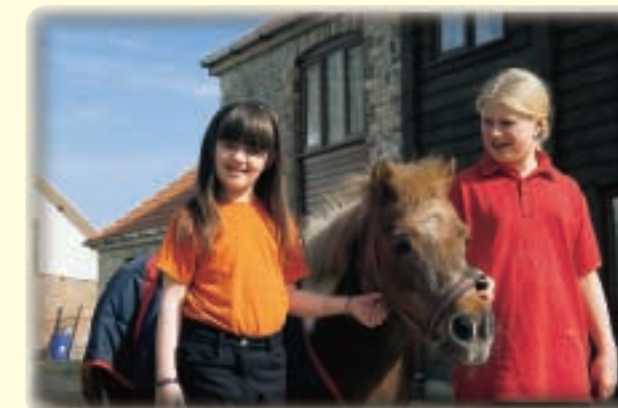
"Brandy The Shetland Pony behind the Granary"