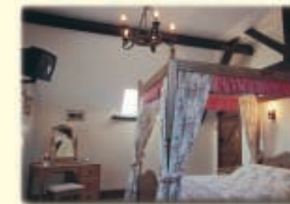
"Stables four poster with en suite"