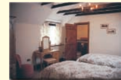
"Granary Twin with en suite"