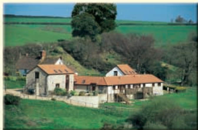
"East view" with The Granary in the foreground.

The location & accommodation are second to none, which will make an enchanting holiday for all the family.