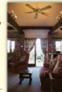
"Ashley's House, Lounge"