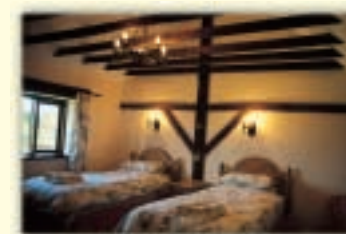
"Ashley's Twin Bedroom, En-Suite"